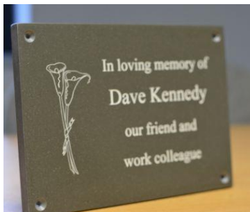
Slate Effect Memorial Wall Plaque

In addition to text, the plaque could include graphics, eg a flower, toy, animal, photo. Samples below: