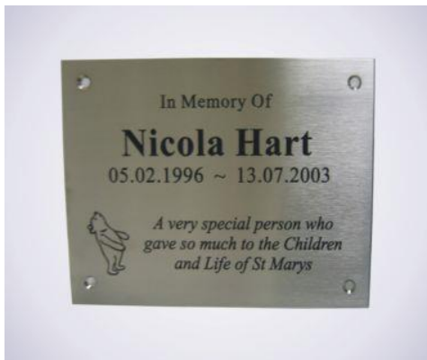
Stainless Steel Memorial Wall Plaque