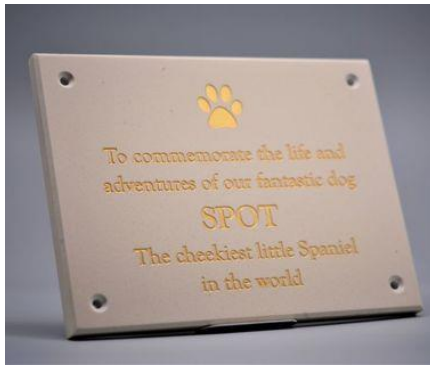
New Sandstone Effect Memorial Wall Plaque