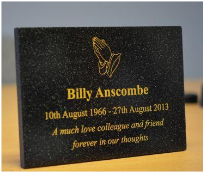
New Quartz Effect Memorial Wall Plaque