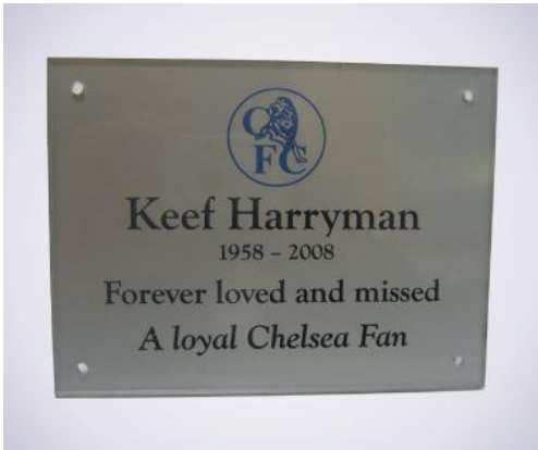
Cast Acrylic Memorial Wall Plaque