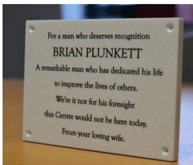
New Marble Effect Memorial Wall Plaque